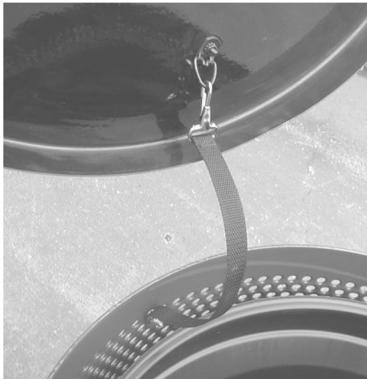
Lid attached to Receptacle with Nylon Web Tether