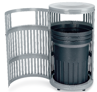
Receptacle L2019 shown in textured silver.