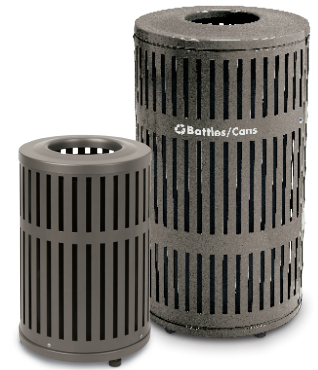
Receptacle L2008 and Recycler L2006 shown in textured bronze.