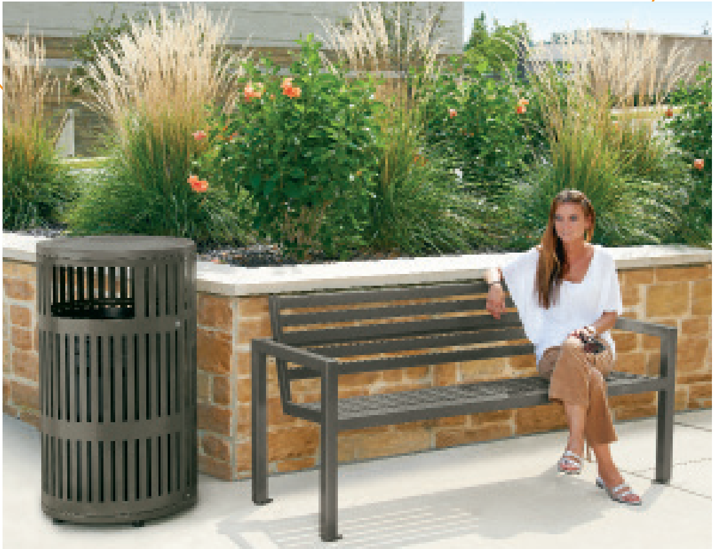
Contour Bench L2016 and Receptacle L2009 shown in textured bronze.

Straight lines, crisp angles and comfortable design make the Metrix Collection the ideal solution for your modern space. This collection features contour or flat bench styles in a variety of lengths. Receptacles are available in 16, 40, and 50-gallon capacities.