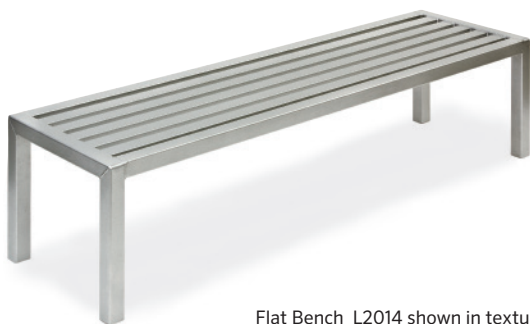
Flat Bench L2014 shown in textured silver.